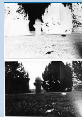
“About” text and images from Wikipedia

Cameras using small apertures, and the human eye in bright light both act like a pinhole camera.